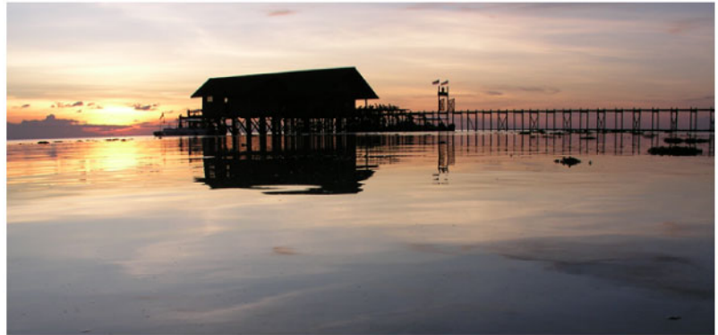
Remember our perfect sunset?